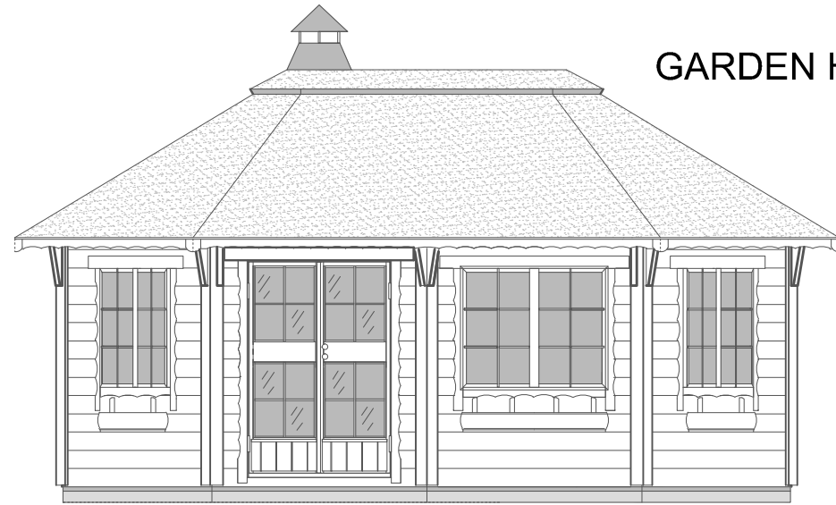
ARCTIC FINLAND HOUSE HUVIMAJA VICTORIA OVAALI 18 m 2